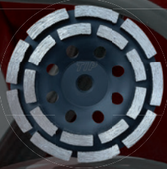
BRICK CONCRETE MASONRY