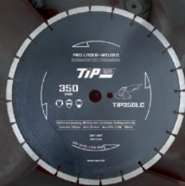
CONCRETE MASONRY REINFORCED