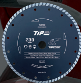
ABRASIVE CEMENT BLOCK BRICKS