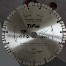
HARD OLD CONCRETE CURB STONE