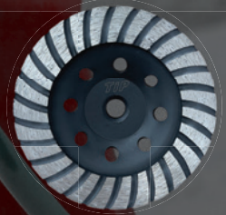
BRICK CONCRETE MASONRY