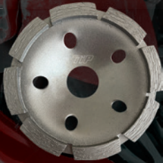
BRICK CONCRETE MASONRY

MARBLE • GRANITE • MASONRY GENERAL BUILDING MATERIALS