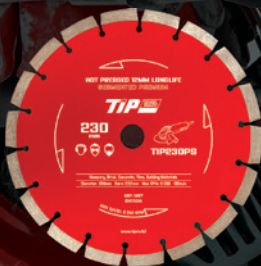
BRICK CONCRETE MASONRY